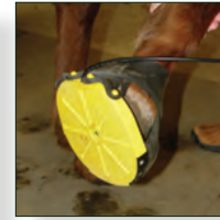
Under-The-Hoof Plate front, back, and bottom