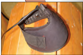
Over-the-Hoof "OTH" Therapy Pad

US Patent No. 7,503,927 Other Patents Pending