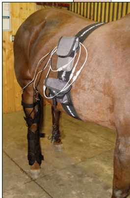
Hock Wrap and Coffin Bone Wrap with Power Unit