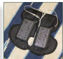
Hock Wrap with Pads