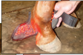
Over-the-Hoof "OTH" Therapy Pad