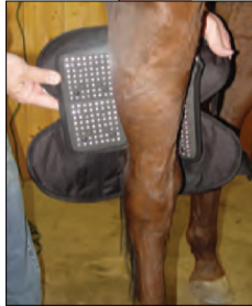
Hock Wrap with Pads