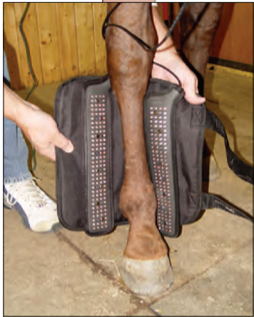
Coffin Bone Wrap with Pads

The new Equine Pro Kit by Xanacare, designed to promote total horse care.